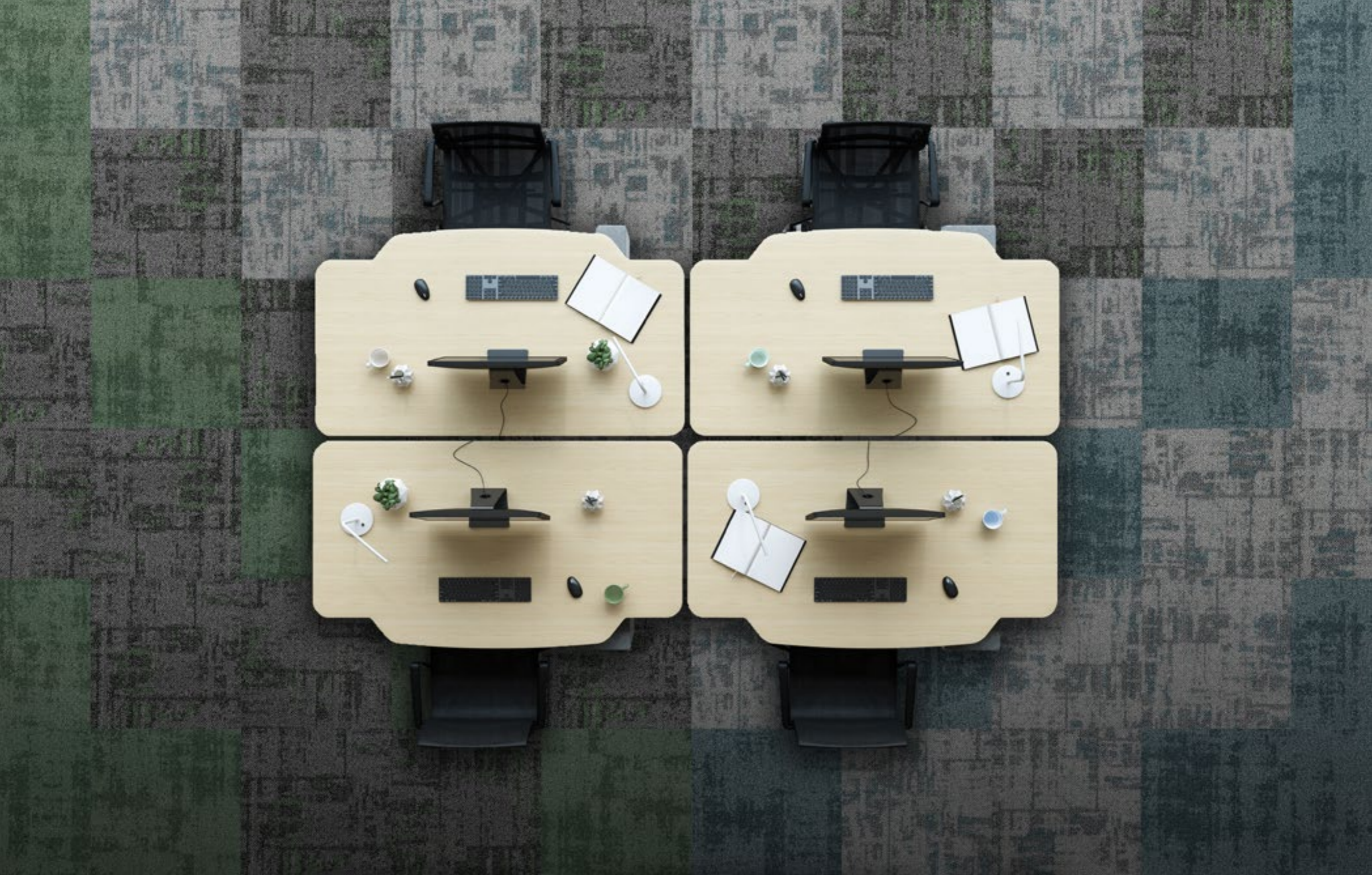
Wettle 202 & 401