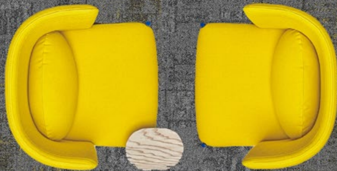
Wettle 100 & 101 & 300 & 302