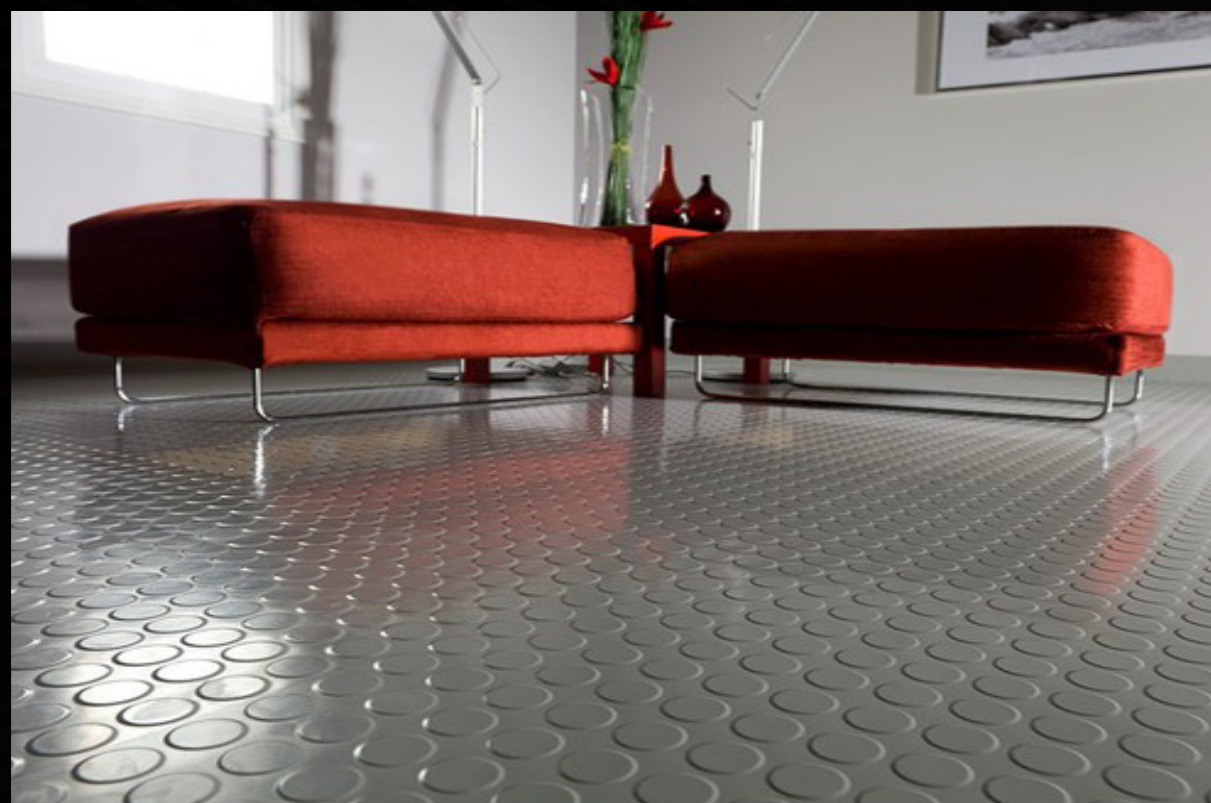
• Rubber Vinyl Flooring